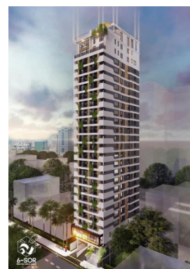
PARC 21 Residence

The PARC 21 Residence, a new residential development in Chamkarmon, reports steady construction and is on track for its expected completion in June 2022 despite Covid-19. The project is currently topping off its 22nd floor and has started work on the swimming pool and other amenities located on the roof deck. The PARC 21 Residence is backed by an international group of investors based in Singapore and Hong Kong. It adopts the Singaporean design philosophy of a "A city in a garden" which builds residential units based on smart spatial planning and natural light allowing fluidity of movements. PARC 21's location in a widely popular area among locals and tourists will only benefit from the expected economic recovery by the time of its completion. The PARC 21 Residence also offers a 21% Guaranteed Rental Returns over three years, a highly competitive rate based on the developer's confidence in the market's potential to bounce back.