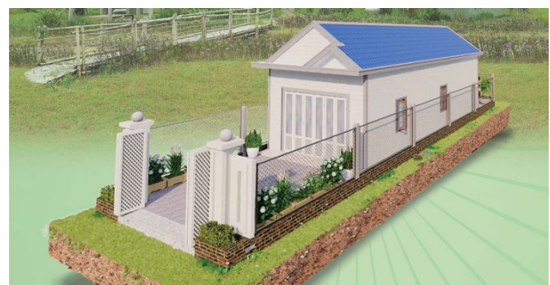
Affordable model housing

The Mekong Homes project by ISI Steel has launched a new affordable house model to fulfil the needs of small and medium land plot owners in Cambodia. Launched on 14 August, the event hosted real estate developers and microfinance